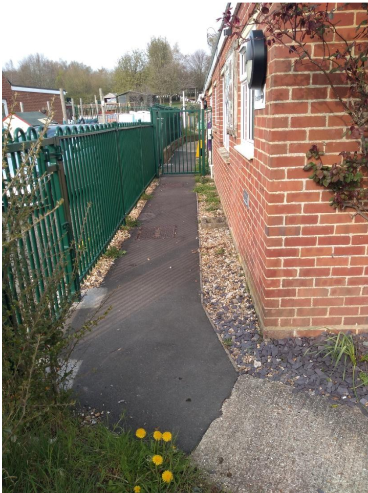
Area currently used for scooter and bike parking.

There is no public transport serving the school. Throughout the village there are very few pavements, footpaths or cycle paths. Pedestrians and cyclists travel on road. There are some bicycle racks at the rear of the school, but these are rarely used. Pupils who cycle or scoot currently leave their bikes or scooters at the side of the school outside the school office window. There is no parent waiting shelter.